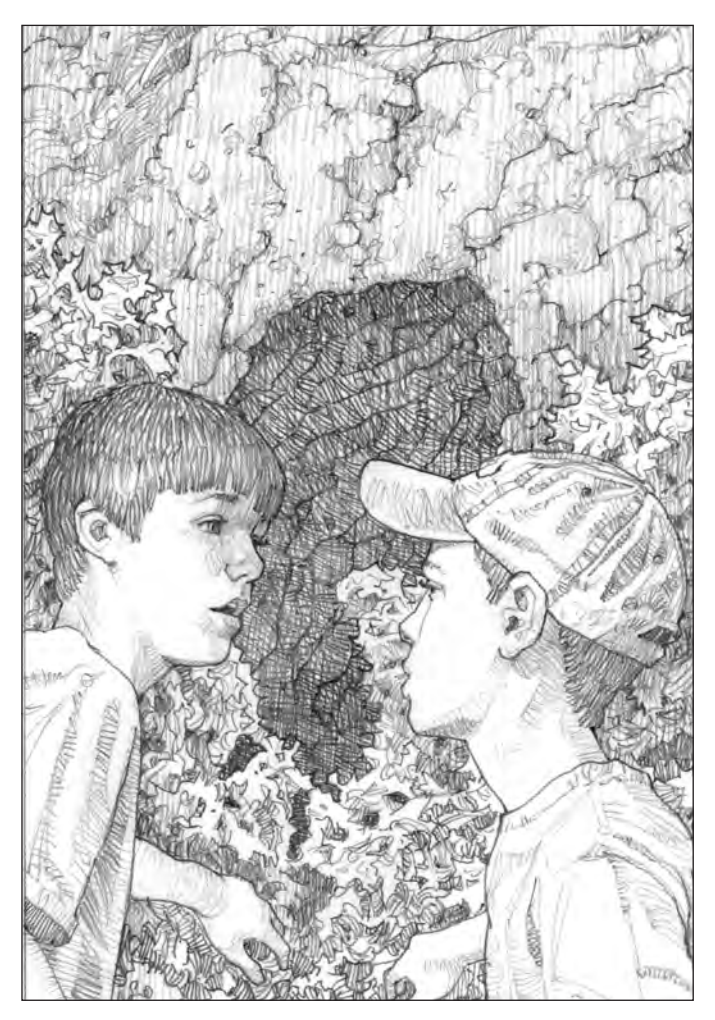
"Look at that," Tom said. There was a hole in the hill.